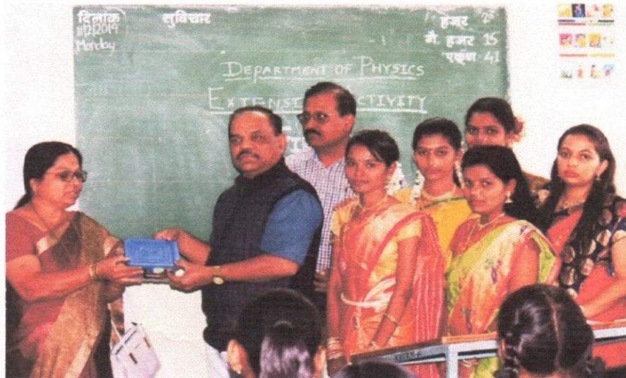
Department of Physics Extension Activity First Aid box donated girls school